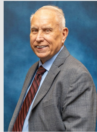
Mayor Rick Roquemore